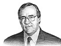
Terence Corcoran Are we back in the 1970s?